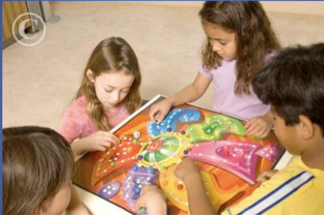
u18124481 [RF]